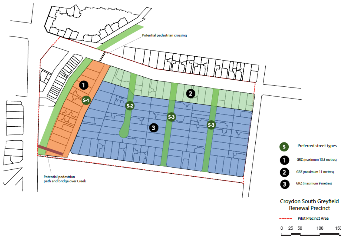
Figure 3: Planned Infrastructure Projects in Croydon South Greyfield Precinct DCP Area