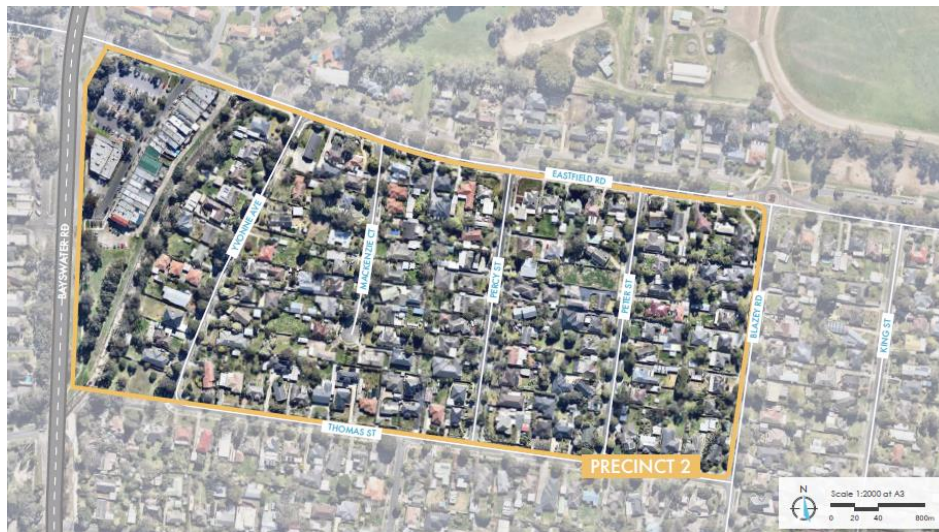
Figure 2: Croydon South Greyfield Precinct DCP Area